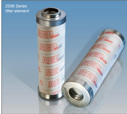
Table 3: Return-line filter elements for Hydac standard collapse pressure elements (bypass valve in housing). 10 bard (145 psid) collapse rated.

Check for interchangeability in the listing below: