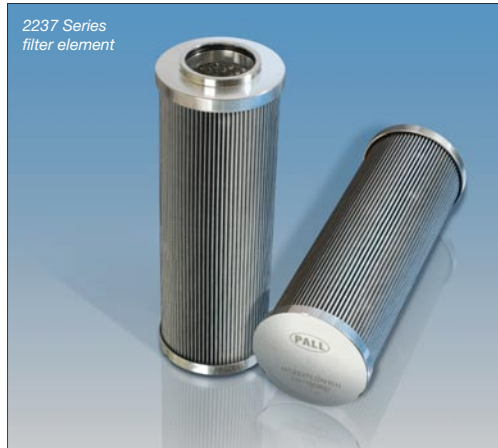
Table 4: High collapse pressure filter elements for use in non-bypass filter applications. 210 bard (3045 psid) collapse rated.

Check for interchangeability in the listing below: