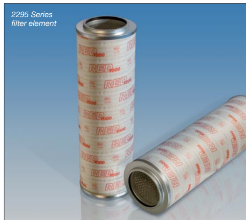
Table 1: Return-line filter elements for use with re-usable bypass valve (3.4 or 5.6 barg (50 or 82 psid) setting). Re-usable bypass valve must be ordered separately. 10 barg (145 psid) collapse rated. For equivalent filter with integral, disposable bypass, see table 2.

Check for interchangeability in the listing below: